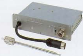
VC-10 VHF converter unit

VHF converter (118 - 174 MHz) for the R-2000. RF attenuator (10 dB) is built-in. (The VC-10 may not be available, depending on the regulations of each specific country.)